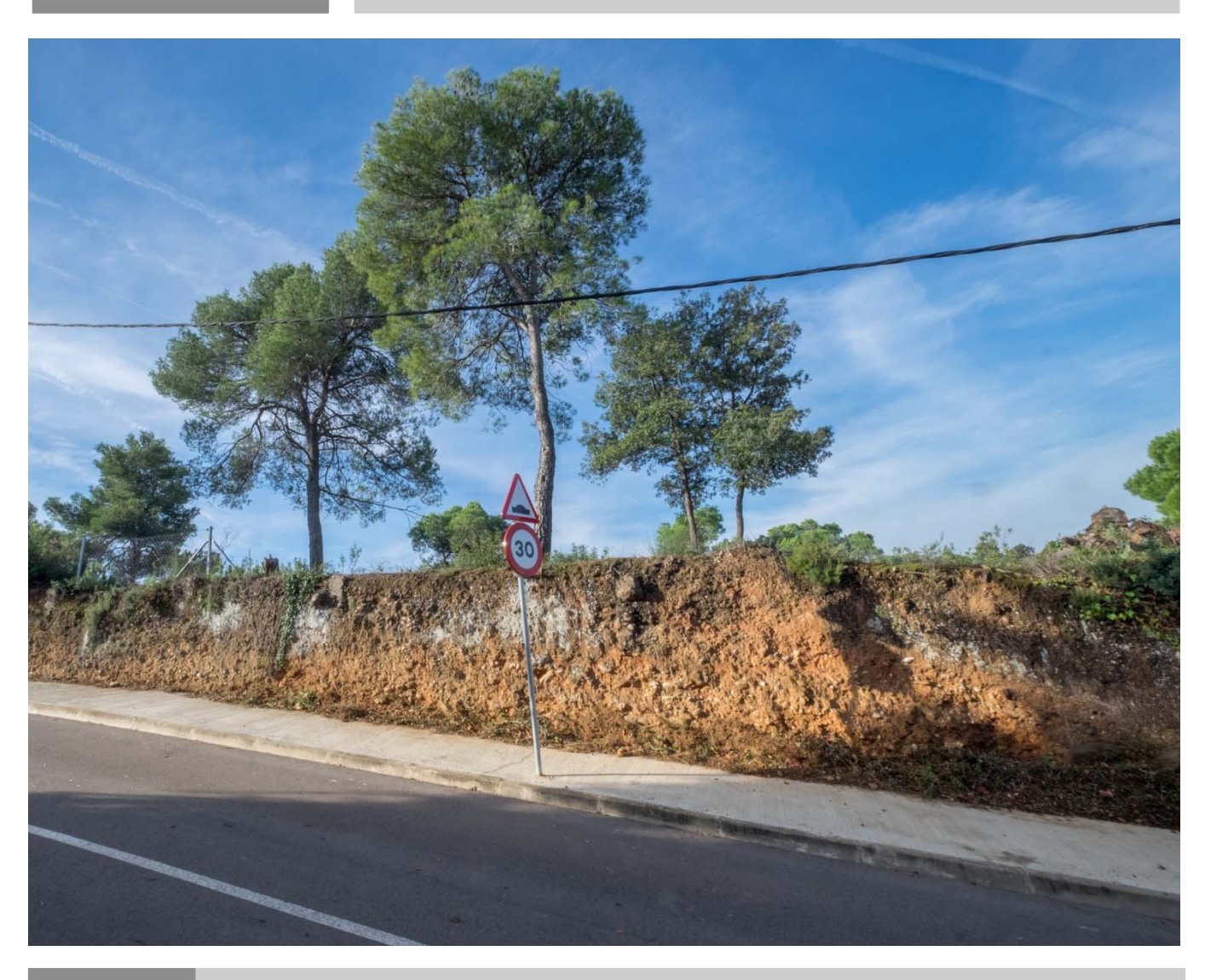
Plot in "La Floresta": Paseo Caqui 2 (Sant Cugat, Barcelona)